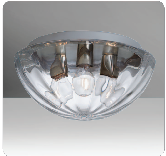
PINTA 15 CEILING SHOWN IN CLEAR (906388C)

UL or ETL Listed. Suitable for Damp Locations (interior use only).